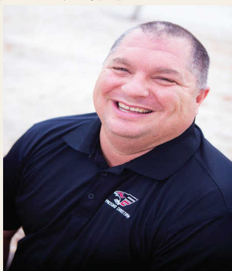
"My journey to becoming Fresno Christian Schools Superintendent and being part of the FCS community has left me feeling like adopted alumni."

Fresno Christian Schools is another good thing, I feel honored to be a part of a community where the focus is equipping young people to love the world as Jesus loves me. I look forward to this journey of making Fresno Christian Schools a place where young people meet Jesus.